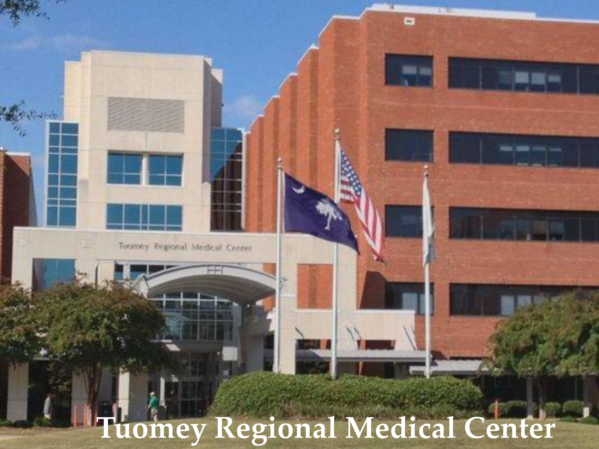
Tuomey Regional Medical Center